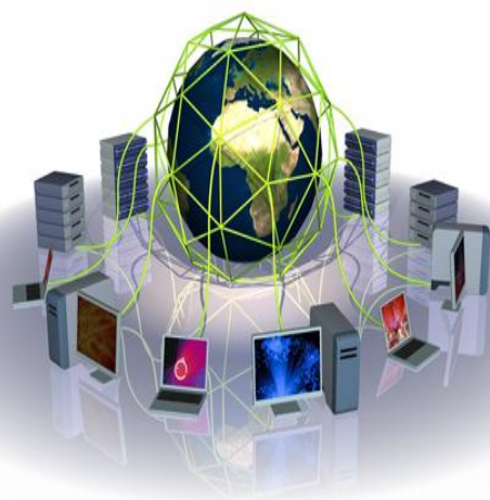
Figure 1: Grid computing

Grid computing is a combination of –PaaS, IaaS, SaaS . As (IaaS) Infrastructure as a service, it provides hardware and network facility to the end user; thus end user will itself installs or develops its own OS, Software and application. As (SaaS)