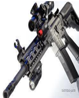
Fig 3: Angle setting gun.

In this above figure we can easily analysis what is the process is going on and how it is used total representation in the fig 3. It is very easy processing to control the operate from near and long distance. By using this problem we can save the money and time without tension. In this technology is very useful for all kind of peoples. Each and every second we can observe what's going on.