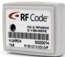
fig: active tag in this paper implementation we are taken the some physical objects that are arduino uno board for sending the signal and smart phone or android phone for receive the signal from active tag and passive tag.

Now let's start for implementation of this paper