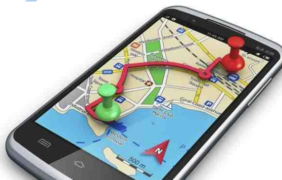
fig 3: output representation and intration between smart phone and chip interaction.

in this above figure we can easily analysis what is the process is going on and how it is used total representation in the fig 3. it is very easy processing to about how to find out the animals.. Hear no suffering about the any problems. By using this process we can save the money and time without tension. In this technology is very useful for formers and whose are depends on the profit from animals.