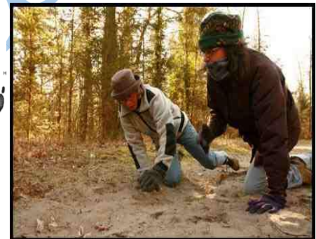
fig1: in olden days animal tracking

in this figure simple representation in olden days and also presented days in some areas it plan will be applied because that areas has no technology . That way those are fallow this method.