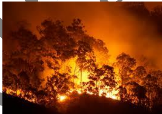
Fig1: this is the simple figure representation for fire occur

Above figure is the simple figure representations for fire occur. At the time fire attacking we have no information at that time this will be happen. At this time we loss the more number of tree, forest fire is most effect on the society. Now a day's forest fire identification equipments are very rare. Present technology using we can identify has taken more time that the reason we can loss the more trees and more valuable equipments. Presently identification technology is any one of the human directly identifying and then call to the related office that the time those are control the fail. In this process we can't chance to identify at very little stage of the fire present. So we can skip too easy to control the fire at the initial stage. These are the major miss take in the existing technology and also hear we can allocate the separate person for identification of fair. In these problems over come we can try to develop the different technology.