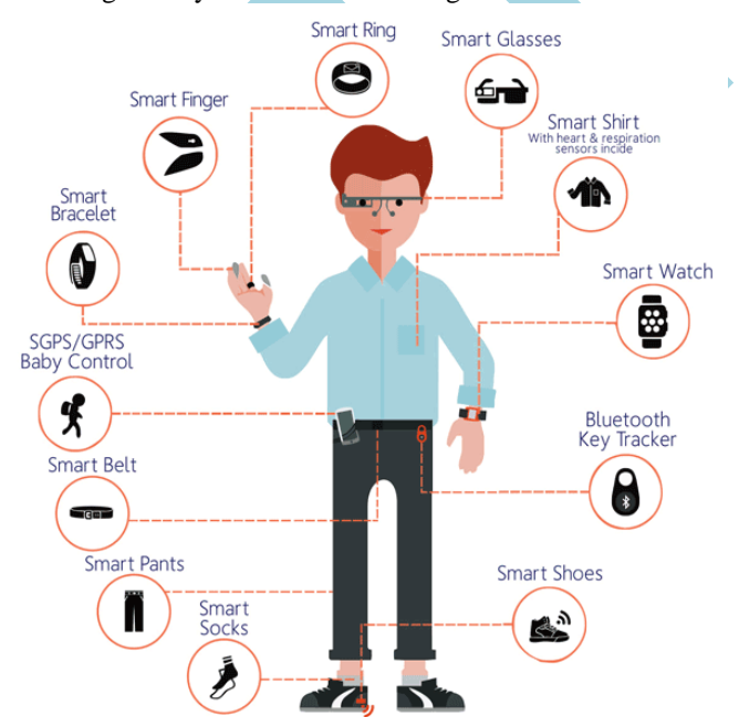
figure 2: Different types of Wearable devices

After the invention of smartphones, wearable electronics are the next big innovation in the world of technology. Wearable technology is a blanket term for electronics so Wearables are electronic technology or devices incorporated into items that can be comfortably worn on a body[12]. These wearable devices are used for tracking information on real time basis. They have motion sensors that take the snapshot of your day to day activity and sync them with mobile devices or laptop computers. There are many types of wearable technology but some of the most popular devices are activity trackers and Smartwatches. Examples include Fitbit, Apple Watch, and Samsung Galaxy Gear as shown in figure 2.