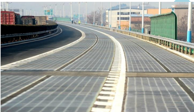
Fig:1 Infrastructure of solar road way

The Solar Roadway distributes its electrical power to all businesses and homes connected to the system via their parking lots and driveways (made up of Solar Road Panels). In addition to electrical power, data signals (cable TV, high-speed internet, telephone, etc.) also travel through the Solar Roadways, which acts as a conduit for these signals (cables). This feature eliminates the unsightly power lines, utility poles, and relay stations we see all over the countryside[2]. It also eliminates power interruption caused by fallen or broken electrical lines or poles.