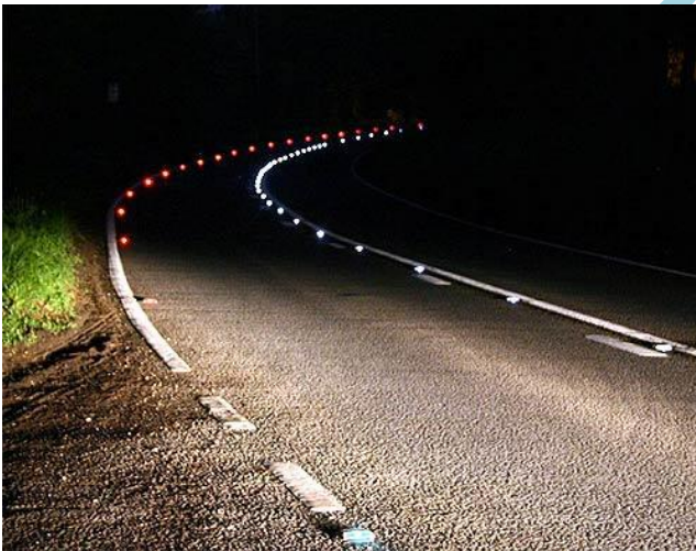
Fig: 4 Illuminated Highway at Night

The LEDs can also be programmed to move along with cars at the speed limit and it gives warning to the drivers instantly when they are driving too fast or the speed of the car increases beyond the speed limit. The LEDs will also be used to paint words right into the road; it gives warning to drivers if an animal arrives on the road, a detour ahead, an accident, or construction work. Central control stations will be able to instantly customize the lines and words in real time, alleviating traffic congestion and making the roads more efficient as well as safer[5-6].