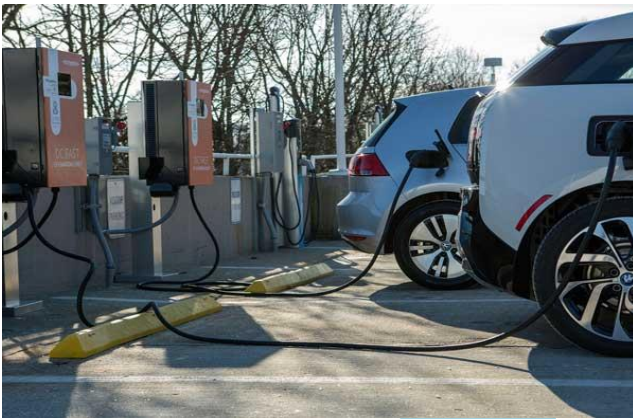
Fig: 5 A model of electric car charging at a parking lot

As wonderful as they are, electric vehicles have a major problem, due to their relatively short range (generally less than 180 miles) they have to be recharged regularly, typically at the owner's home. This means that they would be fit for running to the local grocery store and back, but it wouldn't be feasible to take a cross country trip. Basically, with EVs we can just go as far as our EVs initial charge would take us[2-4].