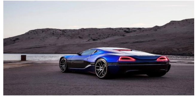
Fig: 6 Currently the electric vehicles are charged from electricity produced from power plants.

The scientific survey in America says (as per July 2010) that the EVs are not ecological in many areas due to less supply or restricted supply of electricity to the areas. A true accounting of the environmental consequences of these cars would have to include the emissions of the power plants that supply their energy. When Department of energy researchers carried out such an analysis, they found that the results are very considerable with geography. By dividing the country into different regions as per the power sources within each region - generally, a combination of coal, natural gas and nuclear energy, with a smattering of renewable energy thrown in. And check how a new fleet of electric cars would alter that supply. Nuclear and renewable, which together account for less than a quarter of the electricity supply, are "always on" sources. Their energy gets used up quickly for routine tasks, leaving little to no green energy left over to help charge a burgeoning fleet of electric vehicles. In practical terms, this means that even if you live down the street from wind farm, its energy is already spoken for before you plug-in your plug[5].