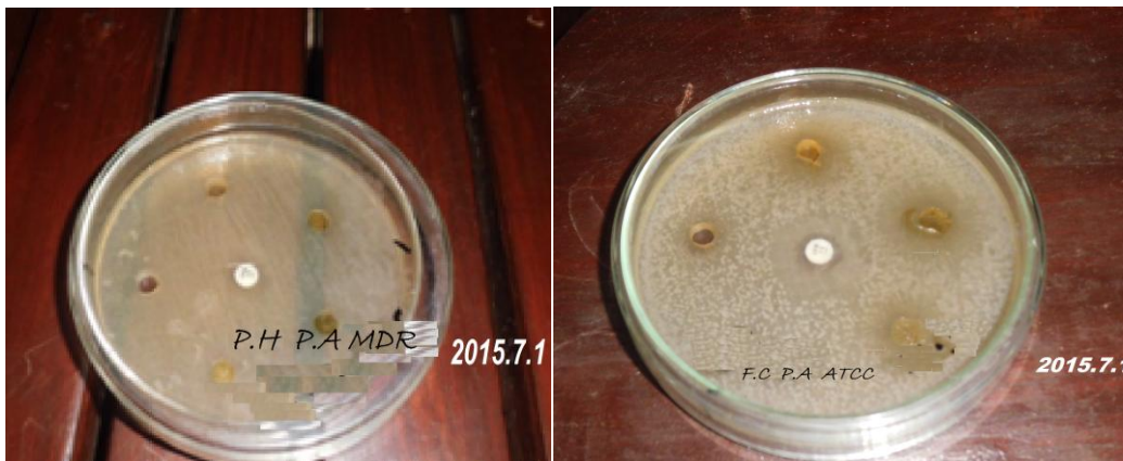
Fig3.4. Zones of inhibition of Root extract of F.C ( Ethanollic ) Against Pseudomonas of F.C ( Ethanollic ) against Pseudomonas